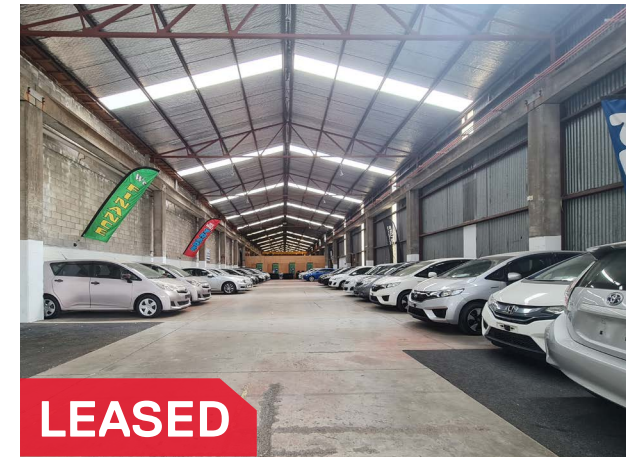
LEASED Unit A, 57 Maurice Road, Penrose Annual Rent | $75,810 Building Area | 722m 2