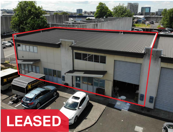
LEASED Unit 7, 18 Lambie Drive, Papatoetoe Annual Rent | $52,450 Building Area | 308m 2