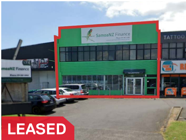
LEASED Unit 6, 53 Cavendish Drive, Manukau Annual Rent | $79,938 Building Area | 489m 2