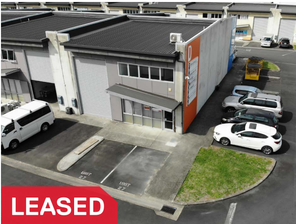
LEASED Unit 27, 18 Lambie Drive, Papatoetoe Annual Rent | $24,520 Building Area | 120m 2