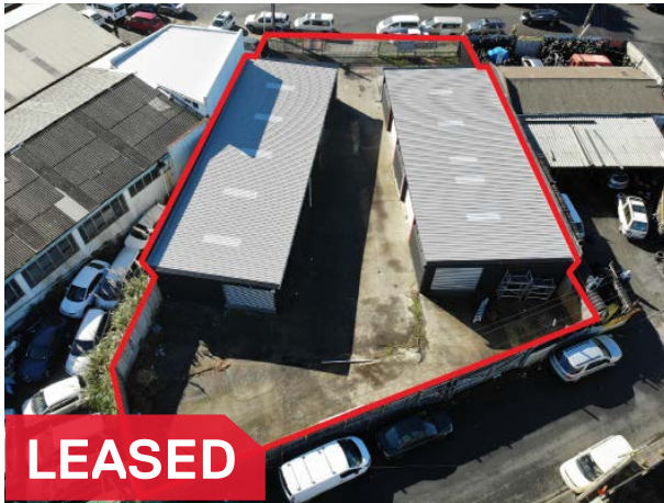
LEASED 6 Lovegrove Crescent, Otara Annual Rent | $70,470 Building Area | 440m 2