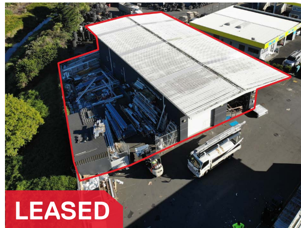
LEASED Unit 4, 116 Cavendish Drive, Manukau Annual Rent | $65,200 Building Area | 500m 2