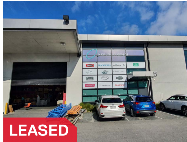
LEASED Unit R, 63 Hugo Johnston Drive, Penrose Annual Rent | $149,800 Building Area | 700m 2