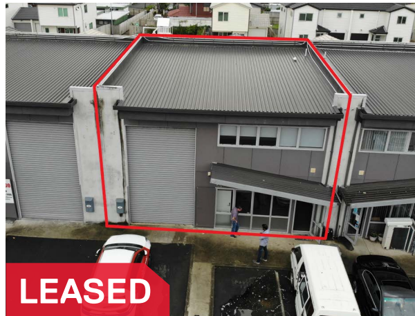
LEASED Unit 43, 18 Lambie Drive, Papatoetoe Annual Rent | $25,000 Building Area | 120m 2