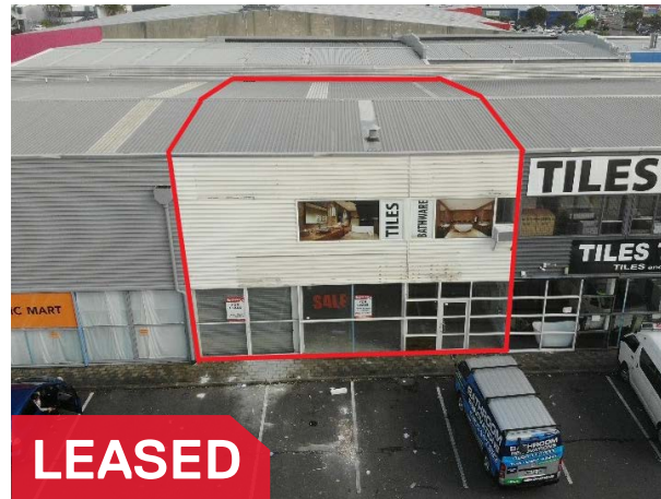
LEASED Unit 11, 40 Cavendish Drive, Manukau Annual Rent | $52,115 Building Area | 307m 2