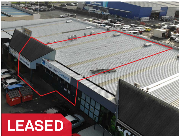
LEASED Unit 4, 57 Cavendish Drive, Manukau Annual Rent | $50,279 Building Area | 367m 2