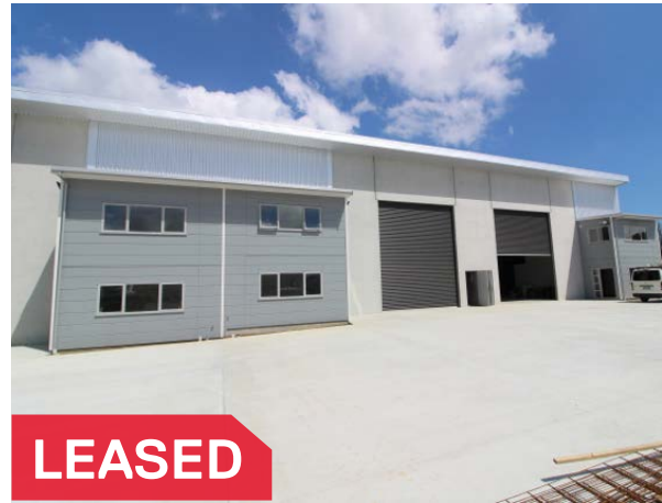
LEASED Unit 3, 12 Marphona Crescent, Takanini Annual Rent | $67,800 Building Area | 360m 2