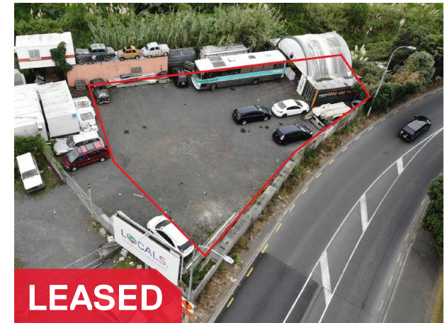
LEASED 51 Onehunga Mall, Onehunga Annual Rent | $51,700 Building Area | 940m 2