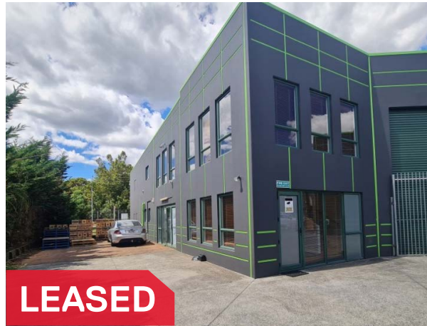
LEASED Unit 5A, 18 Croskery Road, Red Hill Annual Rent | $22,016 Building Area | 92m 2