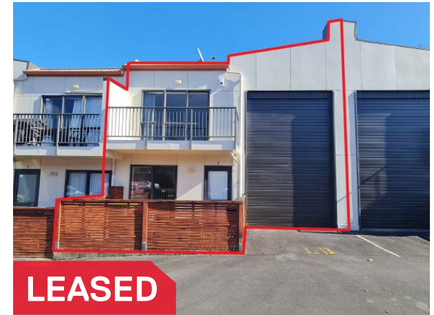
LEASED 14, 3 Tironui Station Road West, Takanini Annual Rent | $30,011 Building Area | 132m 2