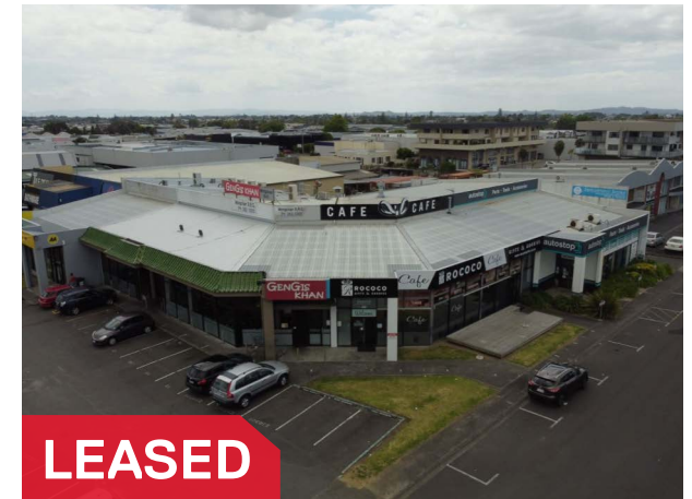
LEASED Unit 3, 39 Cavendish Drive, Manukau Annual Rent | $45,000 Building Area | 280m 2